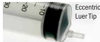
Eccentric Luer Tip